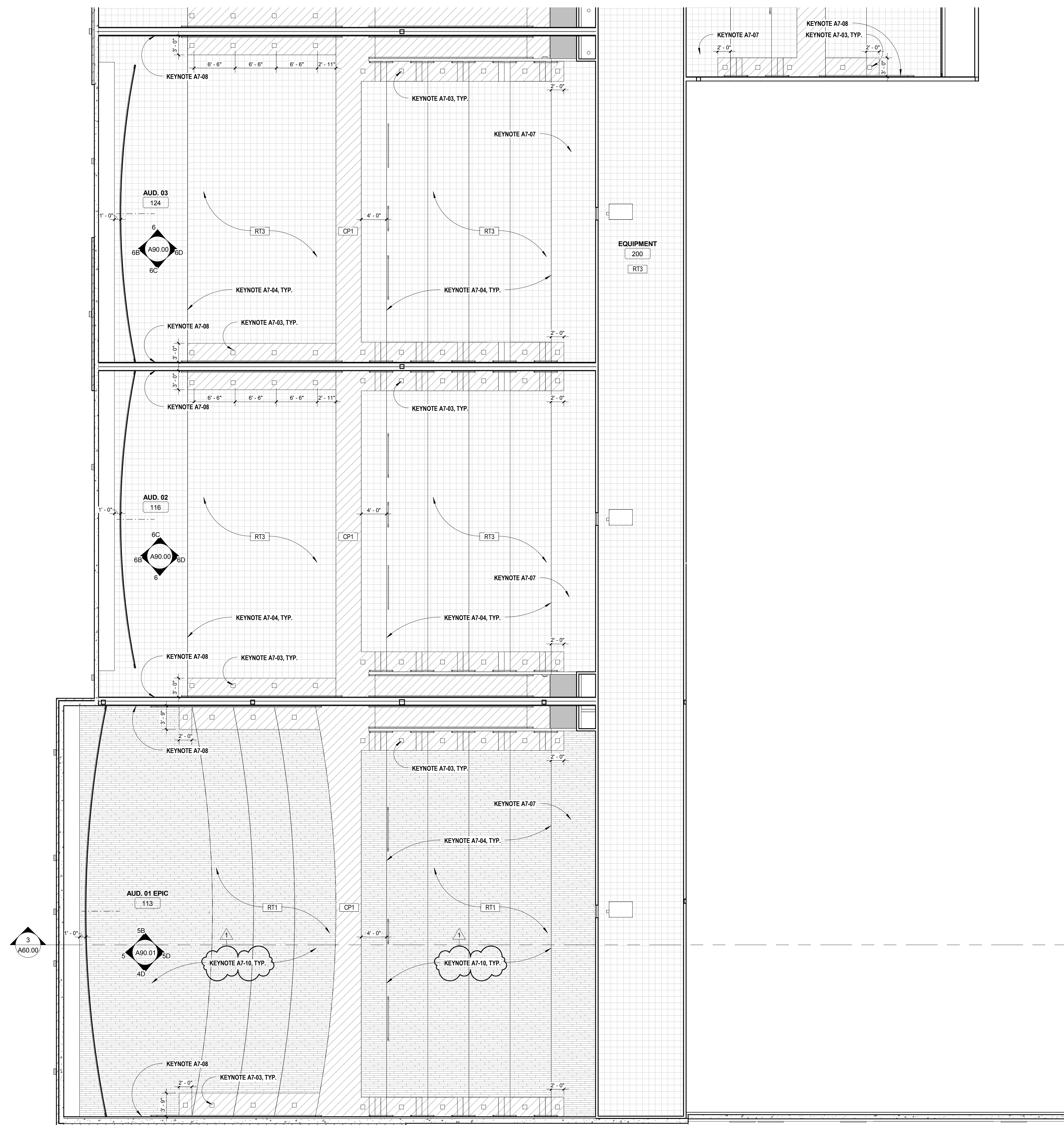
3 LEVEL 2 FINISH FLOOR PLAN AREA 'C' 1/8" = 1'-0"

OWNER Cinergy Cinemas & Entertainment 5720 LBJ Freeway, Suite 625 Dallas, TX 75240 Jeffrey Benson 469-804-7475