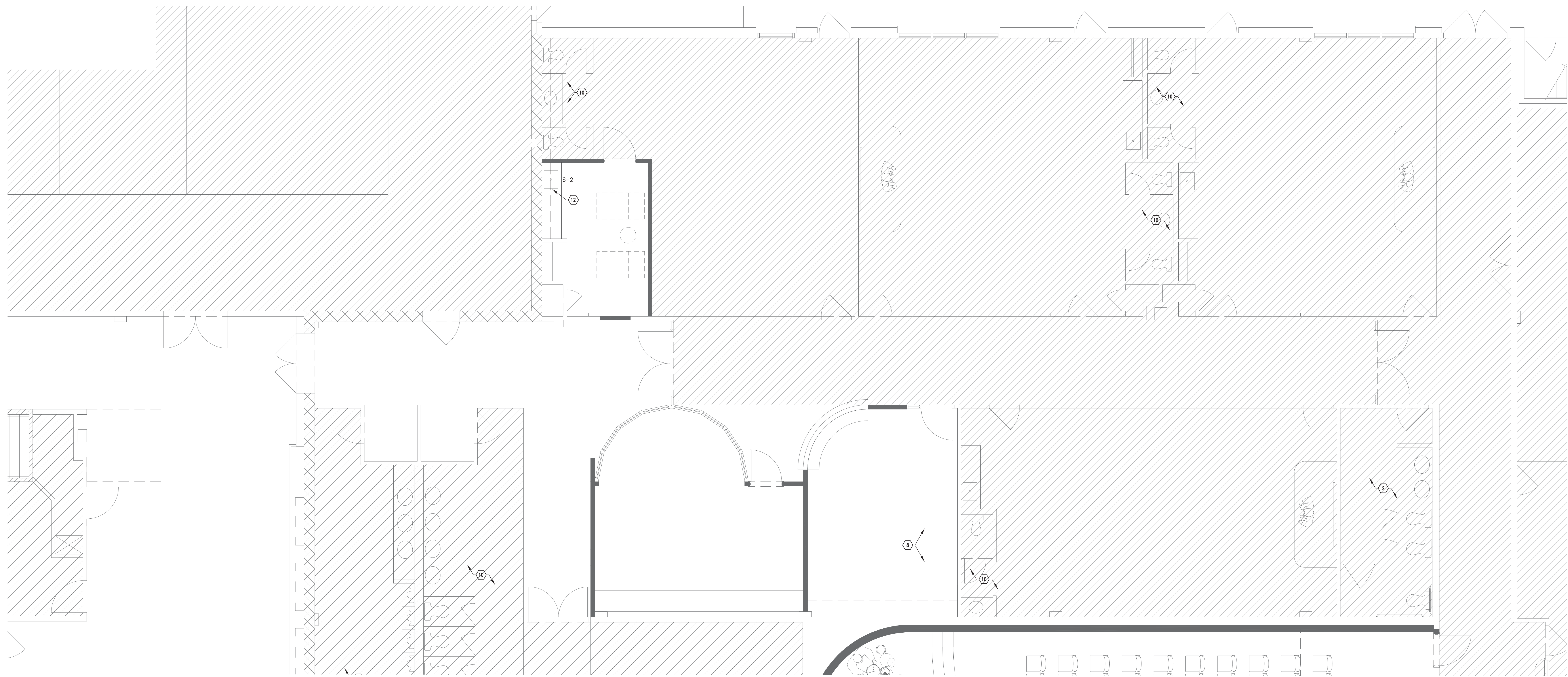
01 KINDER PLAYROOM / MOTHER'S ROOM FLOOR PLAN - WATER - LEVEL 1 1/4" = 1'-0"