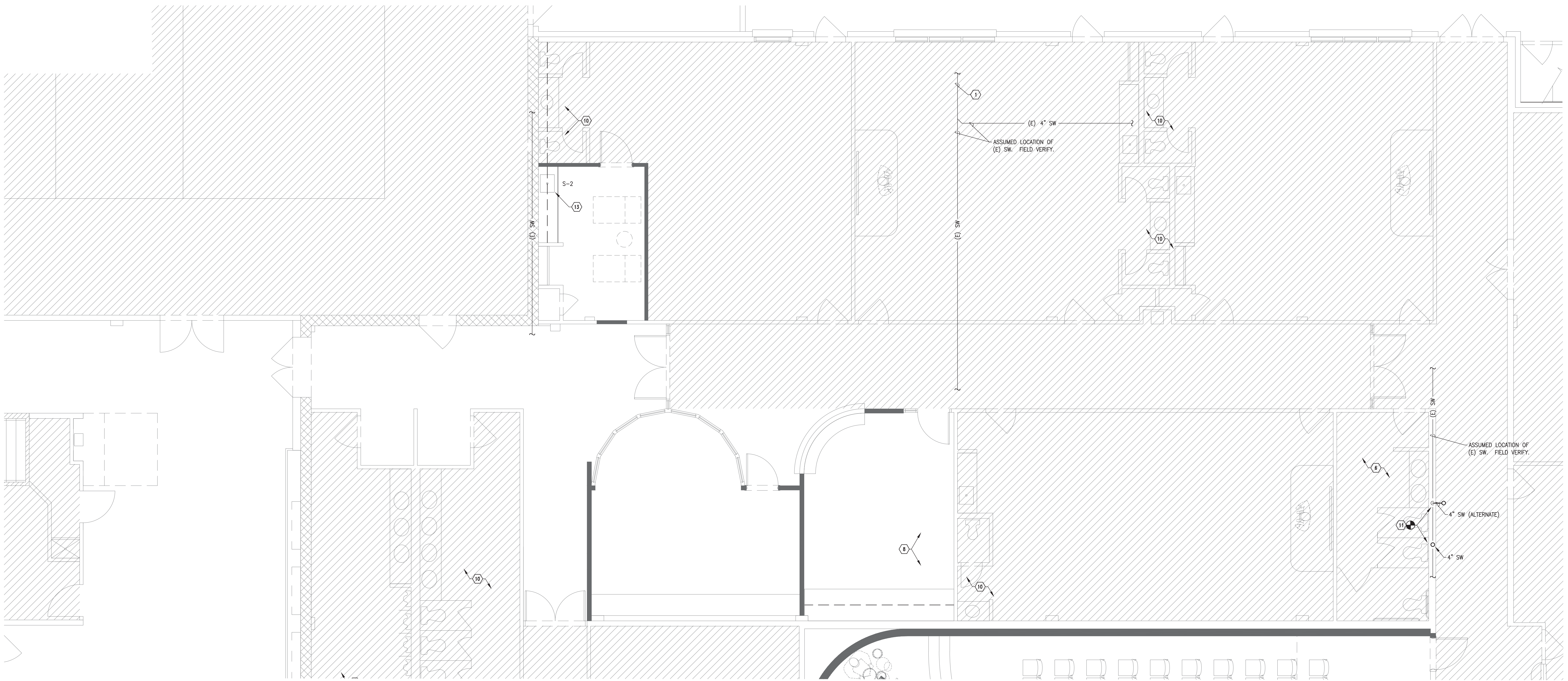
01 KINDER PLAYROOM / MOTHER'S ROOM FLOOR PLAN WASTE & VENT - LEVEL 1 1/4" = 1'-0"

BINNERI PRESBYTERIAN CHURCH RICHARDSON, TX 1301 ABRAMS RD. ROCHARDSON, TEXAS 75081