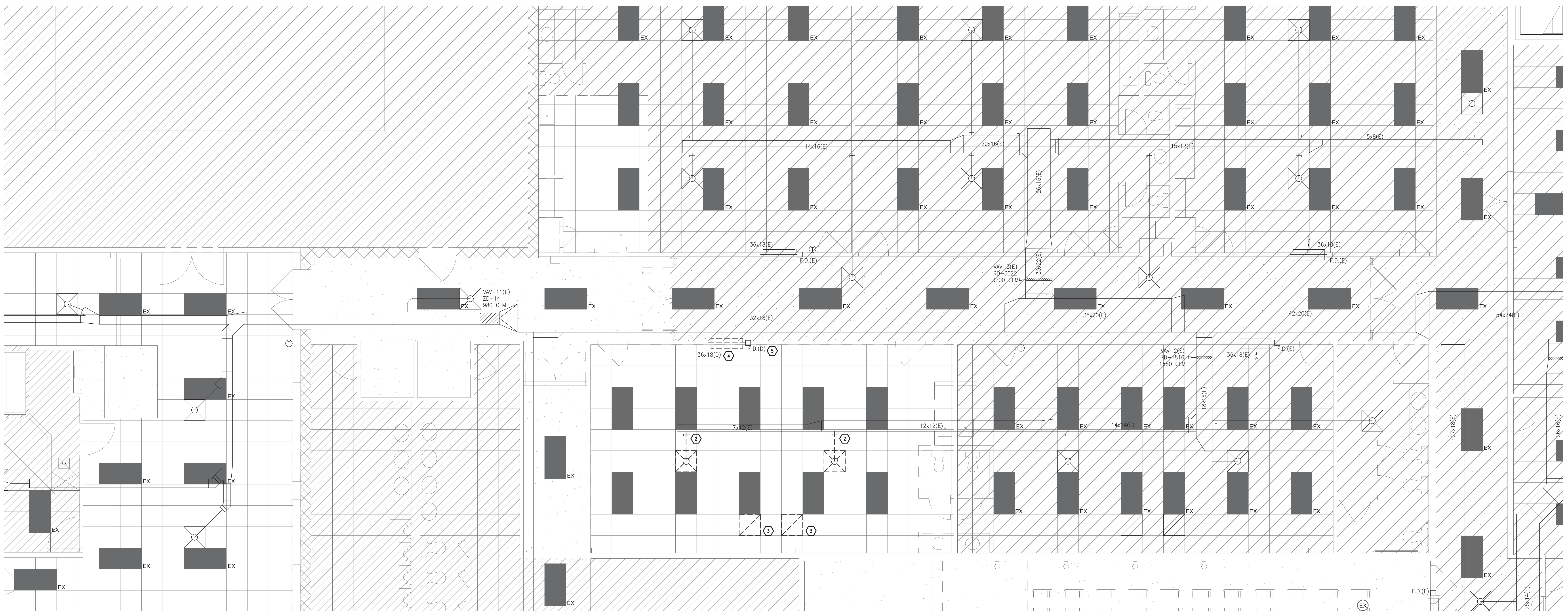
01 KINDER PLAYROOM / MOTHER'S ROOM MECHANICAL DEMO PLAN - LEVEL 1 1/4" = 1'-0"

BINNERI PRESBYTERIAN CHURCH RICHARDSON, TX 1301 ABRAMS RD. RICHARDSON, TEXAS 75081